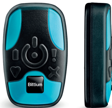
Bittium Faros™ 180

Bittium Faros™ 360 basic package: Faros™ 360 waterproof sensor, 5 -electrode cable set for using with disposable snap-on electrodes OR Bittium OmegaSnap Multi-CH Adapter, USB cable for recharging and downloading data, Faros Manager Software.