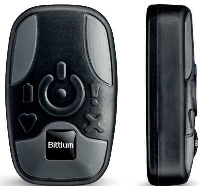
Bittium Faros™ 360