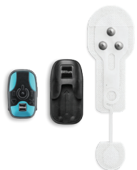
Bittium Faros™ 180L Bittium OmegaSnap™ Adapter Bittium OmegaSnap™ 1-CH ECG Electrode

Bittium's wearable patch electrodes are intended to be used with Bittium Faros™ ECG device for the purpose of measuring cardiac ECG signals. Bittium provides different patch electrodes for measuring ECG with one, two or three channels and they connect to the Bittium Faros™ device through a reusable Bittium OmegaSnap™ adapter.