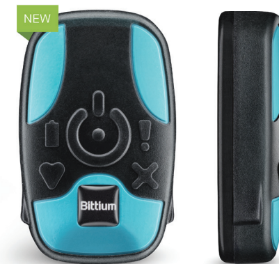
Bittium Faros™ 180L

Bittium Faros™ 180 basic package: Faros™ 180 waterproof sensor, 3-electrode cable set for using with disposable snap-on electrodes OR Bittium OmegaSnap 1-CH Adapter, USB cable for recharging and downloading data, Faros Manager Software.